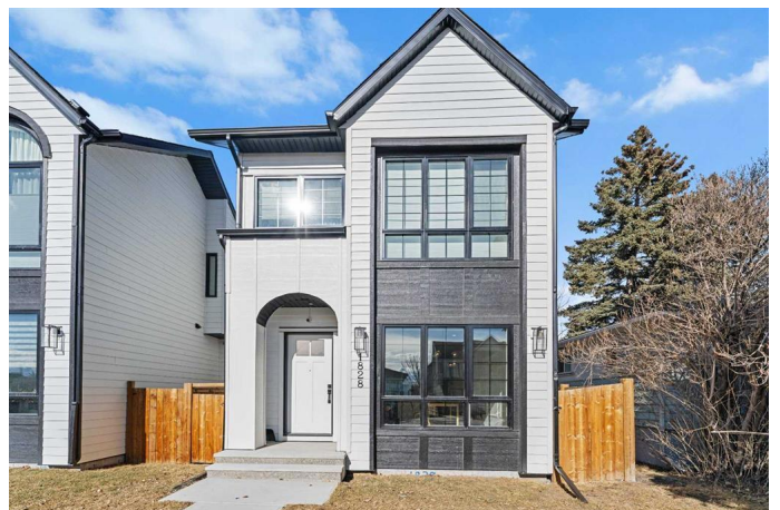
Client: Tri Nhan Le - EXP Realty Address: 1828 18 Ave NW, Calgary Level: Basement